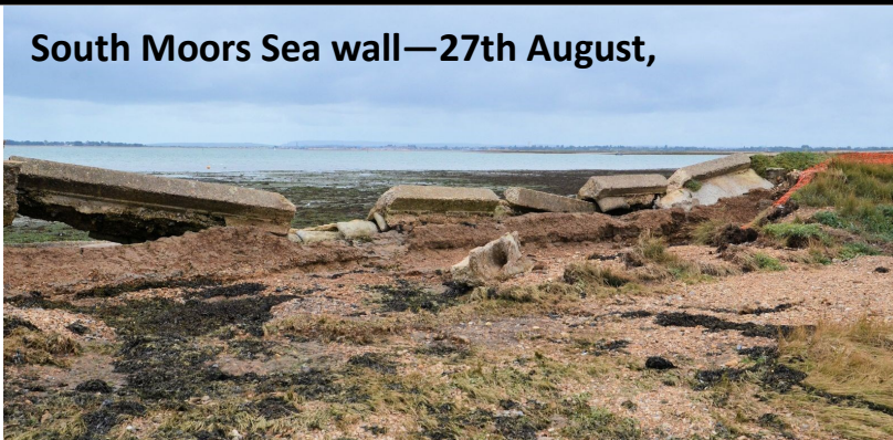
South Moors Sea wall—27th August,